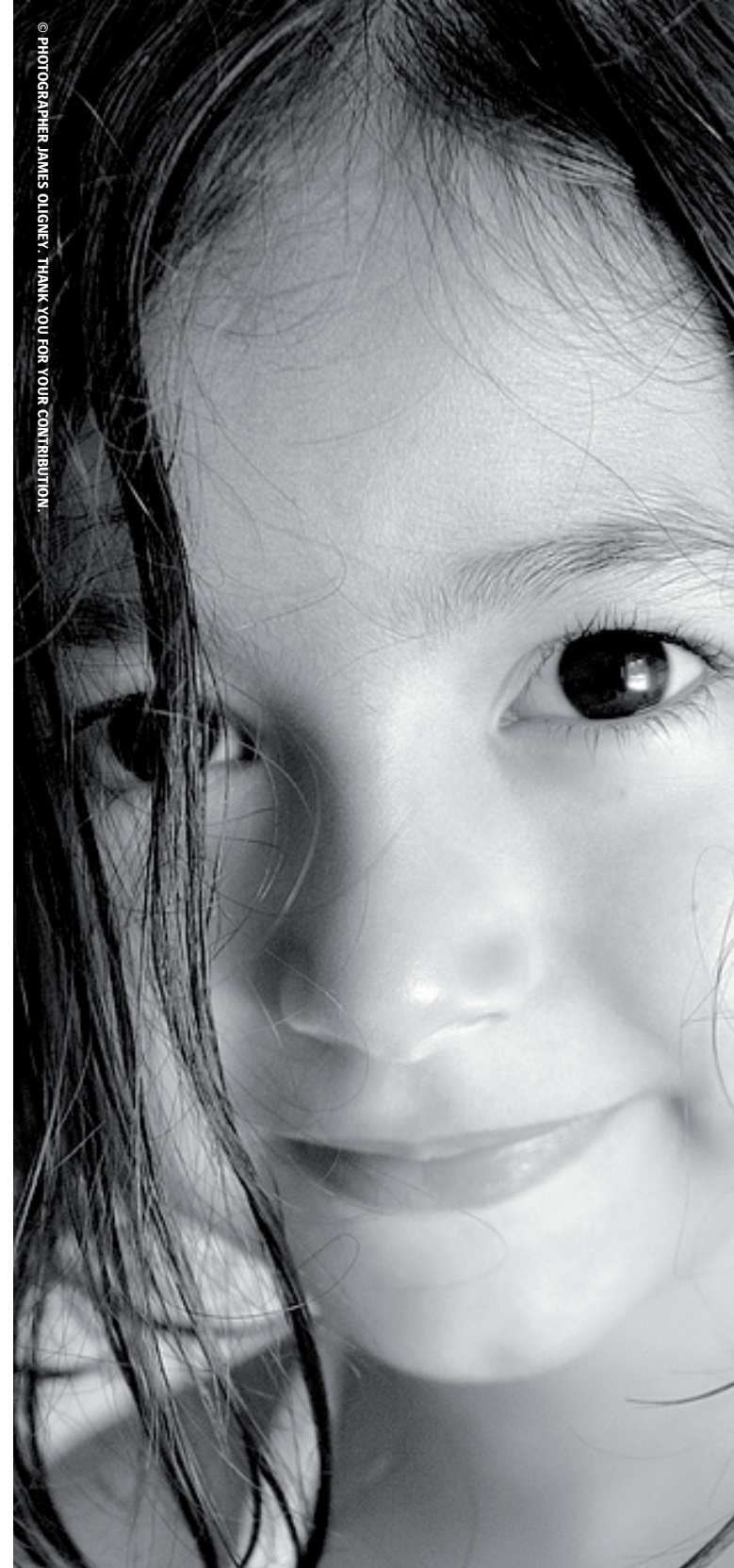
© PHOTOGRAPHER JAMES O'GHEENY. THANK YOU FOR YOUR CONTRIBUTION.